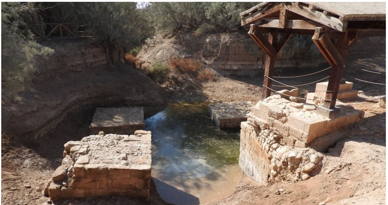
Bethany-beyond-Jordan: Remains of a Byzantine Church erected at the traditional site of the Baptism of Jesus by John.

May the God of all healing and forgiveness draw you to himself, that you may behold the glory of his Son, the Word made flesh, and be cleansed from all your sins, through Jesus Christ our Lord. Amen.